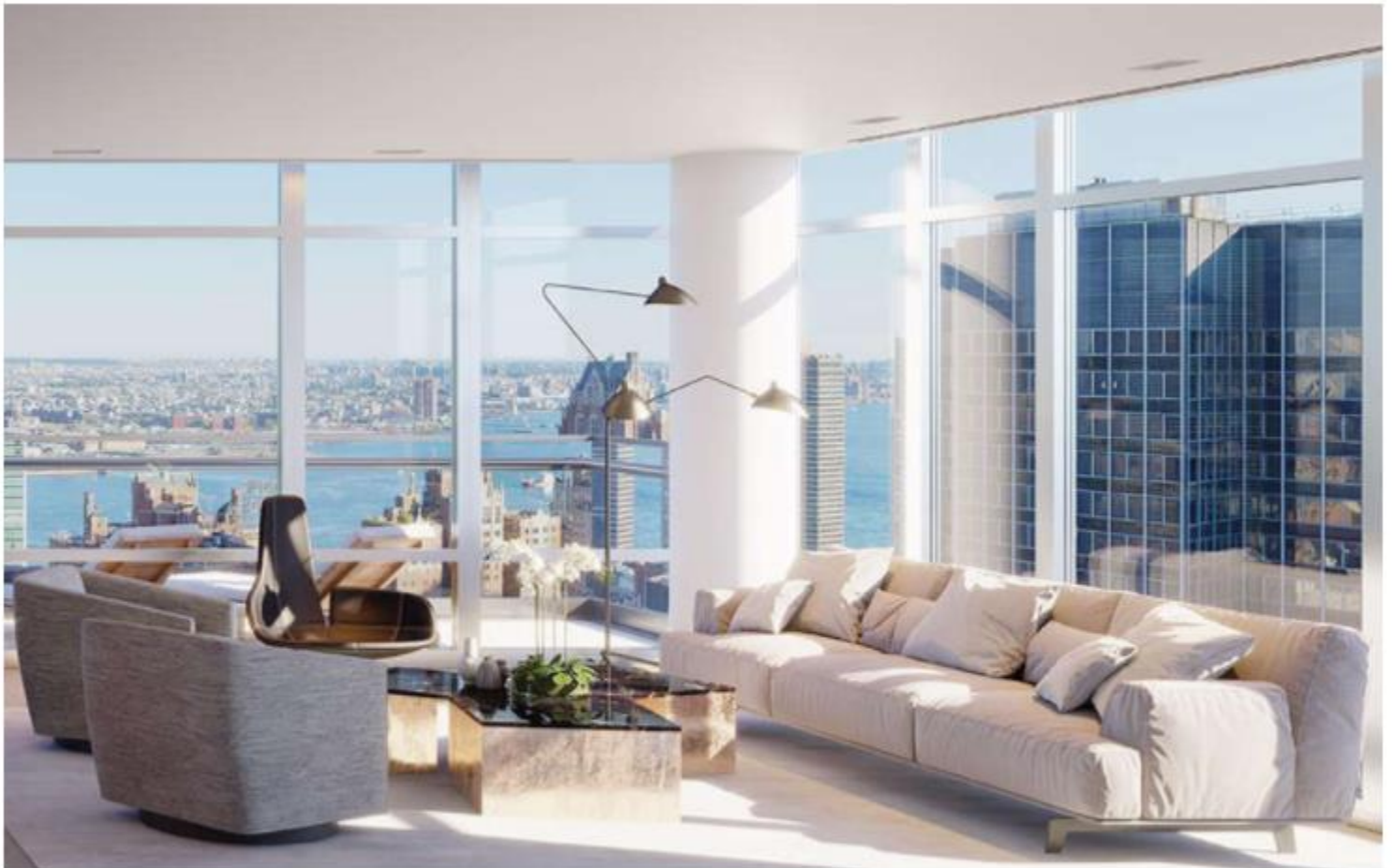
The Residences at The Even Hotel