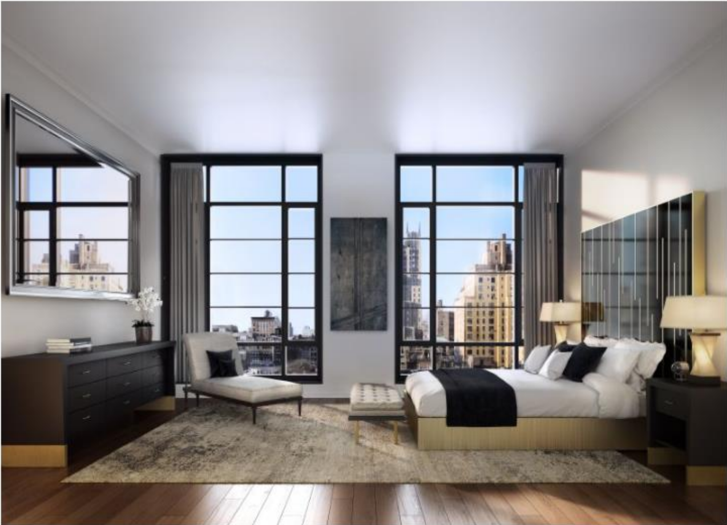
D'Orsay; Photograph by The Neighborhood.