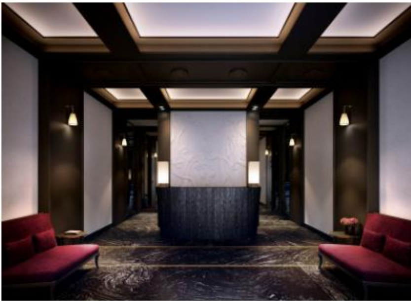
d'Orsay Lobby; Photograph by The Neighborhood.

NYS: Tell us about the French influences you expect to incorporate into the d'Orsay!