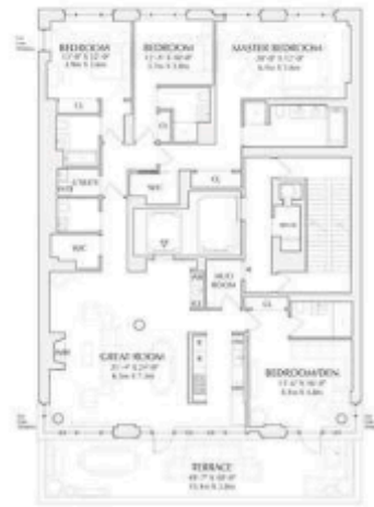
Floorplan of seventh floor unit (Corcoran Sunshine)