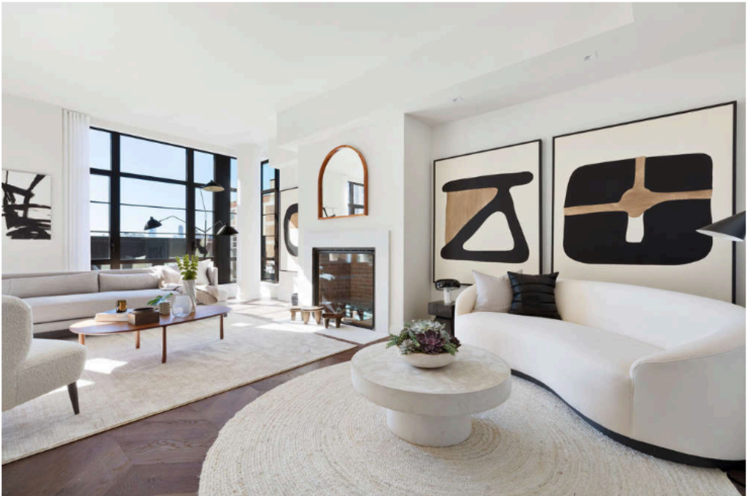
Model home interior of seventh floors unit at The d'Orsay

ASH NYC drew their design inspiration from France, starting with the Parisian AD 100 building designer Jacques Garcia . ASH NYC say they “find inspiration in the confluence of history and innovation. The past lends us the wisdom of civilizations before us; the future is limitless with the possibility of what has yet to be imagined.” The d’Orsay model apartment is the perfect blend of history and innovation from the charm of the casement windows to the high ceilings and luxe, modern finishes.