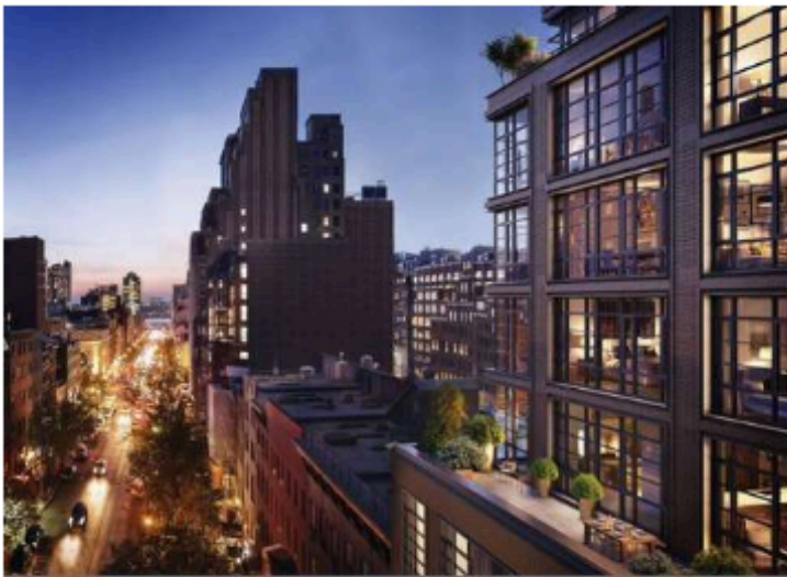
Renderings of d'Orsay from The Neighbourhood