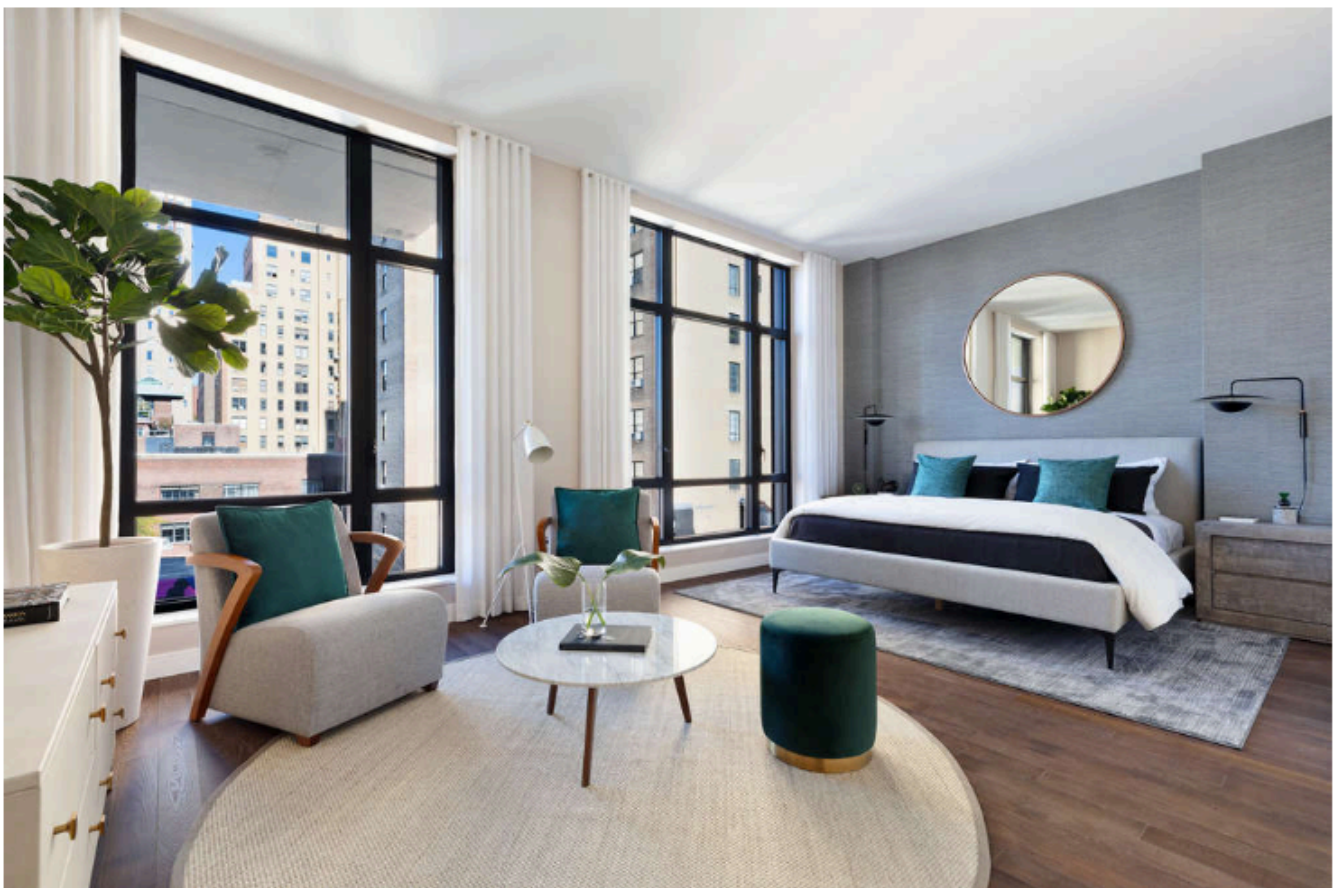
The master bedroom has northern exposures and overlooks a private courtyard