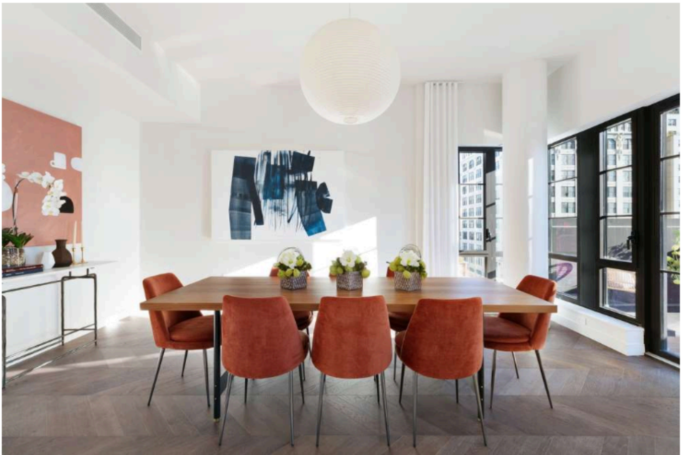
The dining area also provides direct access to a the gracious south-facing terrace